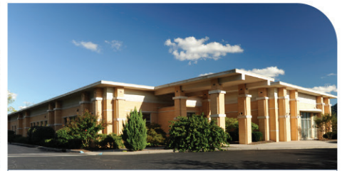
KINGSPORT OFFICE 2300 West Stone Drive Kingsport, TN 37660 (423) 246-4961