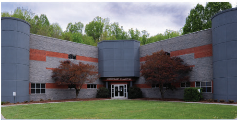
BRISTOL OFFICE 3183 West State Street Bristol, TN 37620 (423) 764-7131

Dermatology Associates is the area's largest dermatology practice, with conveniently located offices in Bristol, Johnson City, and Kingsport. Call today for an appointment! (423) 246-4961