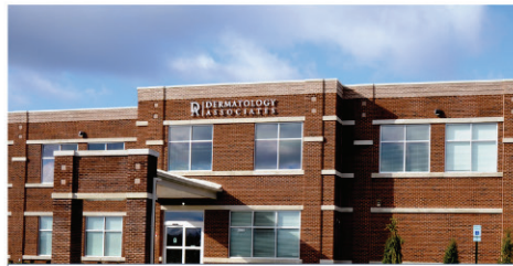
JOHNSON CITY OFFICE 2885 Boones Creek Road Johnson City, TN 37615 (423) 928-9014